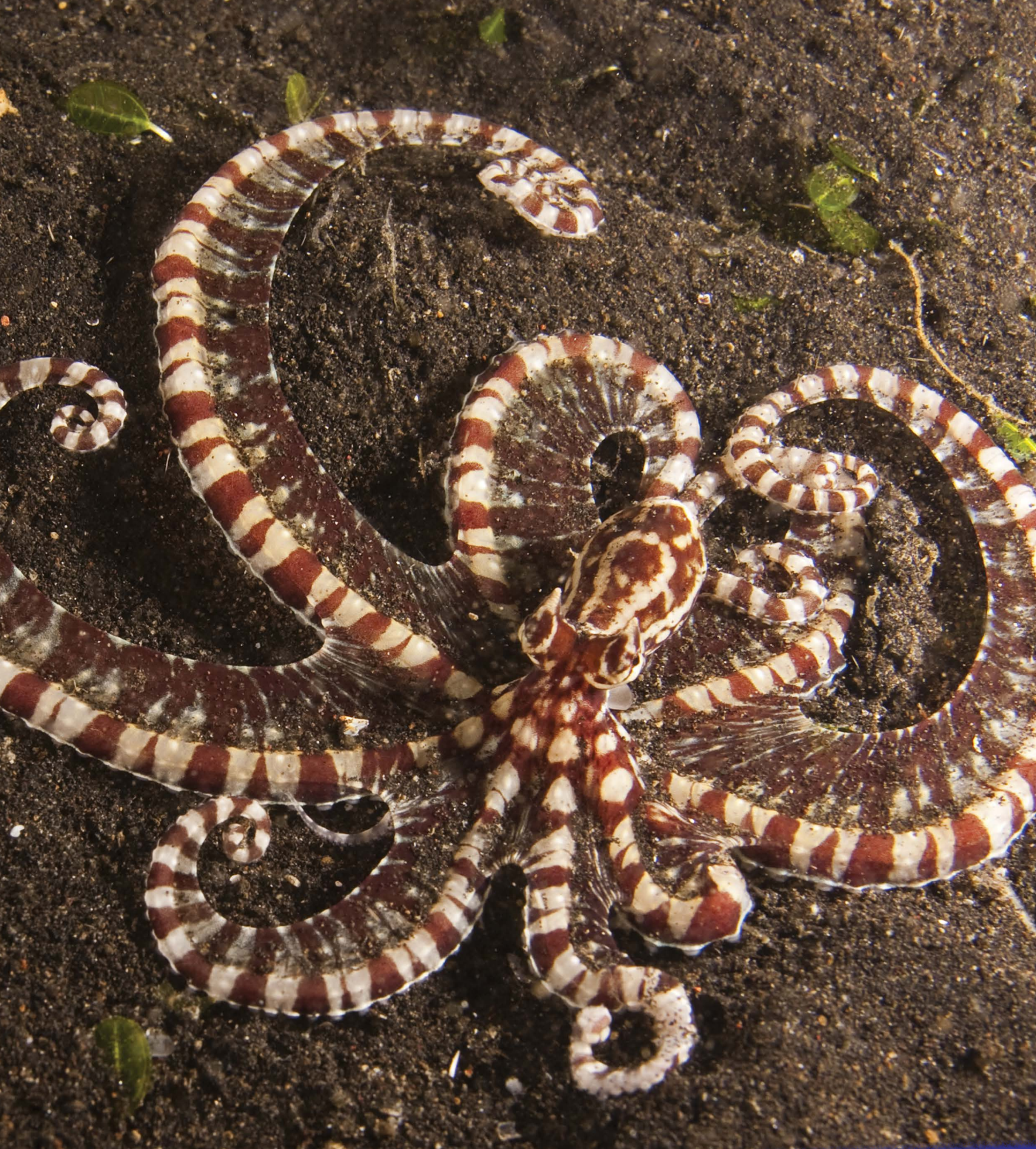
Octopuses camouflage. They hide. They change shape, color, and texture.