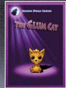
Book 3 (ccvc)