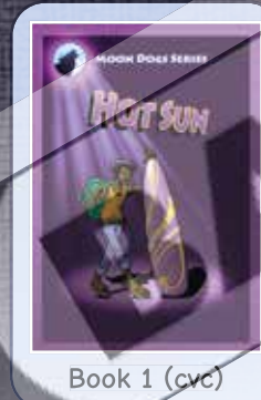
Book 1 (cvc)