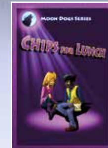
Book 5 (ch)