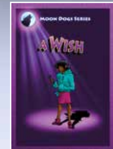
Book 6 (sh)