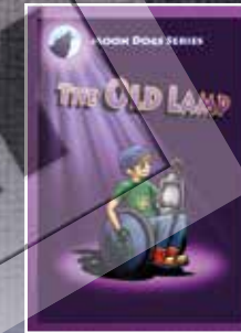
Book 2 (vcc cvcc)