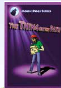
Book 7 (th, ng)