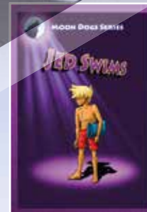
Book 4 (ccvcc)