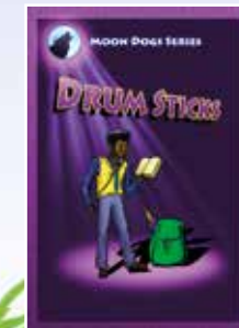
Book 8 (ck, qu)